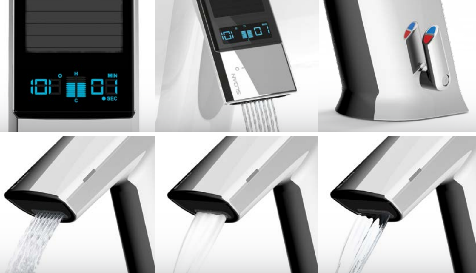
Integrated Side Mixer