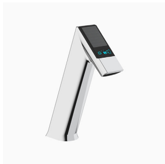
EFX-177 High Body