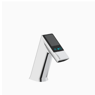
EFX-277 Mid Body