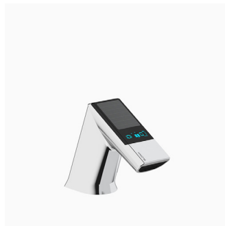
EFX-377 Low Body