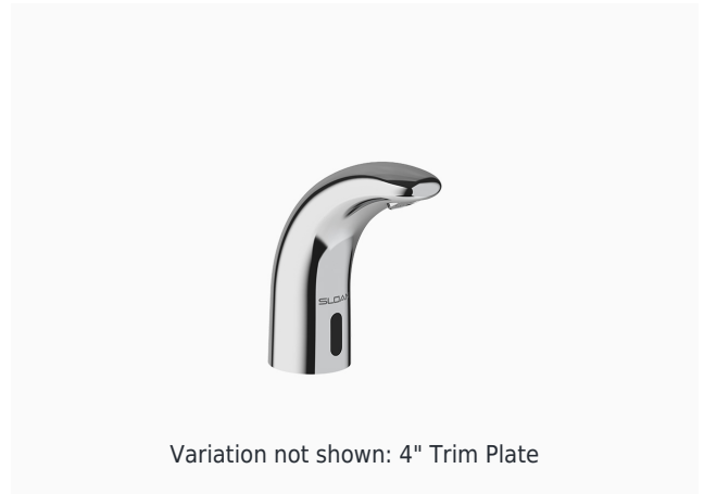
Variation not shown: 4" Trim Plate