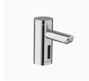
Optima® EAF 275 Solar Powered Deck-Mounted Mid Body Faucet

Sensor-activated faucets are designed to deliver a preset volume of water into a lavatory. Sloan's line of Optima® faucets have a reputation for reliability and proven engineering expertise and a wide range of design and feature options. This line of hygienic, touch-free electronic operation faucets are vandal resistant that stand up to the harshest commercial environments.