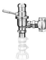
DOLPHIN TYPE 1 CLASS A

**Contact Your Local Sloan Representative