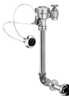
REGAL 940-1.6 XL