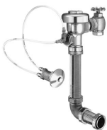
REGAL 9603 XL