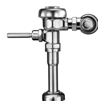
REGAL 180 XL

**Contact Your Local Sloan Representative