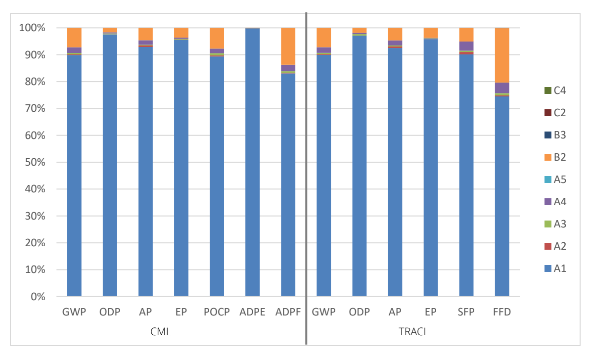
Figure 2. Contribution analysis for the Sloan Basys EFX Sensor Faucets (excluding Modules B4, B6, and B7).

The contributions to total impact indicator results are dominated by the use phase impacts, specifically, the operational energy and water use modules (B6 and B7) with as much as 90% of the overall impacts and secondly by the use phase replacement module (B4). When examining the results without the operation use phase impacts and without the replacement module impacts, the results are dominated by the raw material module (A1) with the product maintenance module (B2) also showing significant impacts.