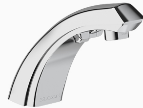
Image for a standard ETF-880 shown