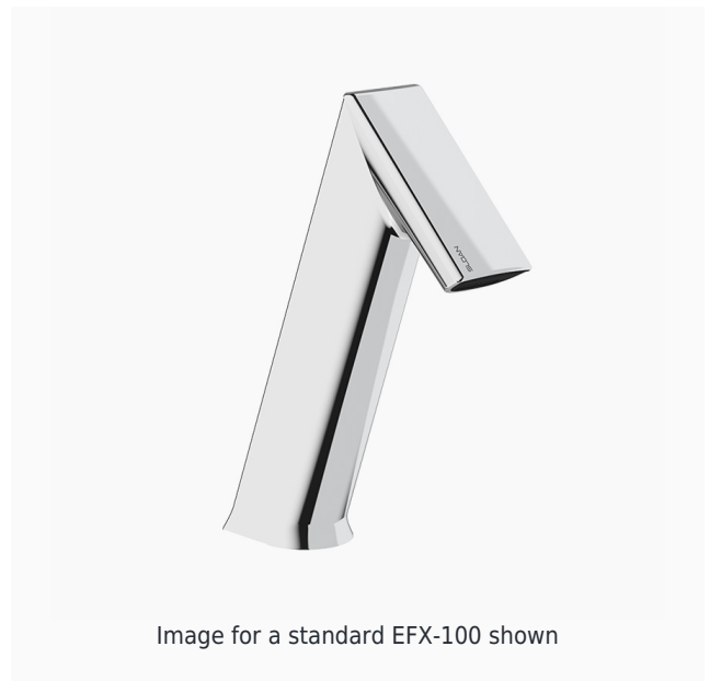
Image for a standard EFX-100 shown