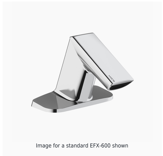
Image for a standard EFX-600 shown