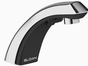
Image for a standard ETF-80 shown