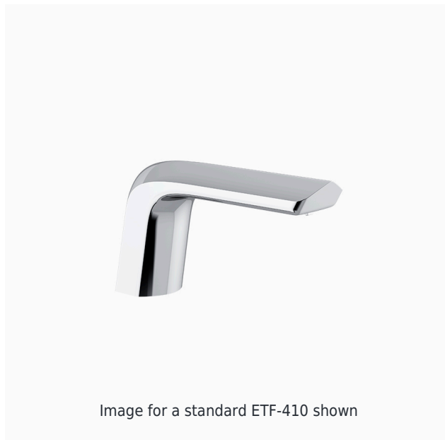
Image for a standard ETF-410 shown

Optima® Hardwired-Powered Deck-Mounted Low Body Faucet