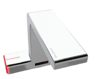
EAF900 Below-deck controls, hardwired with backlight stream and illuminated temperature controls

Soap dispenser pairings available for many models. Contact Sloan for more information.