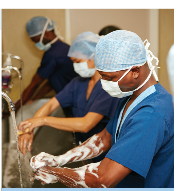
High gooseneck surgical bend perfe