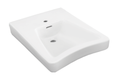
SS-3104 Single Hole SS-3004 4" Centerset SS-3804 8" Centerset