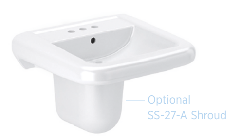
SS-3165 Single Hole SS-3065 4" Centerset