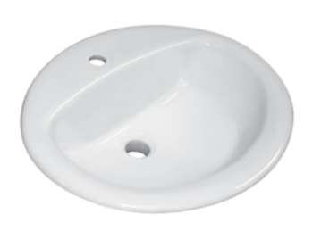
SS-3102 Single Hole SS-3002 4" Centerset SS-3802 8" Centerset