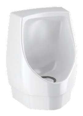
WES-1000 Waterfree HYB-1000 Hybrid HYB-1000-RET Hybrid Retrofit