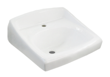
SS-3103 Single Hole SS-3003 4" Centerset SS-3803 8" Centerset