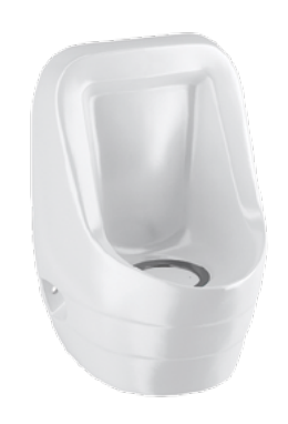
WES-4000 Waterfree HYB-4000 Hybrid