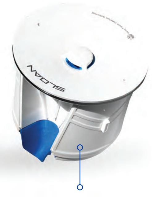
Simplifies maintenance and optimizes cartridge effectiveness

Sloan* Hybrid Urinals feature a multi-patented cartridge, with Falcon Waterfree Technology, for safe, long-lasting, low-odor performance while saving tens of thousands of gallons of water every year. Since the technology was introduced in 2004, there have been several improvements incorporated into the design based on feedback from customers. The latest design follows that same path and includes six all-new features to provide optimal performance.