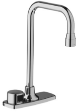
EBF-775 Deck Mount, battery ETF-770 Deck Mount, hardwired