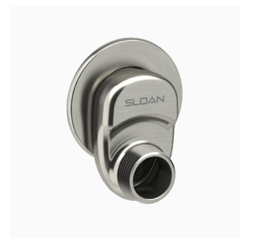
1" NPT × 1½" Offset Adapter in Brushed Nickel H1018A PVDBN