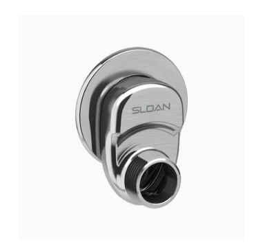
1" NPT × 1½" Offset Adapter in Brushed Staineless H1018A PVDSF

The Offset Adapter is available in finishes to match your existing flushometers for a cohesive aesthetic.