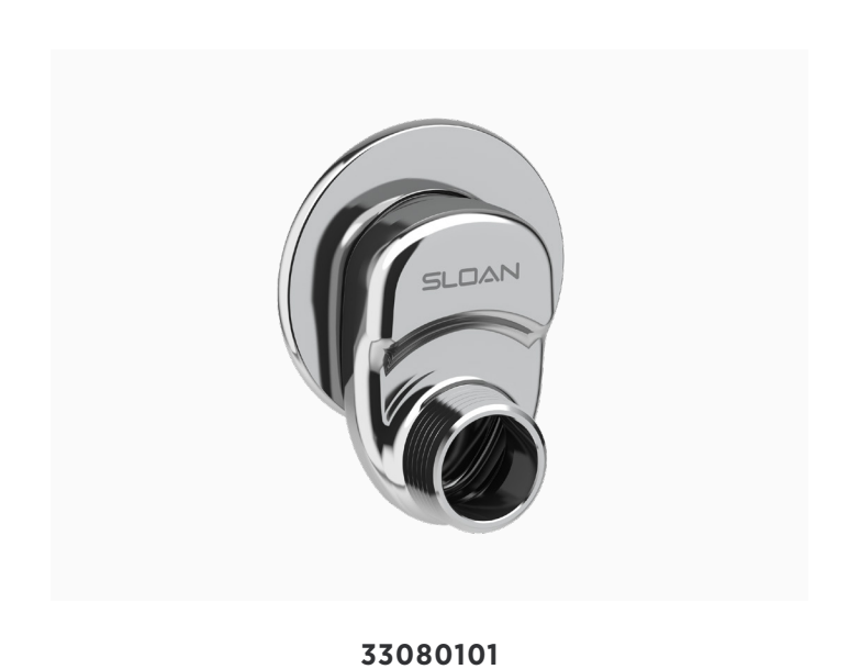
1" NPT × 1½" Offset Adapter in Polished Chrome \label{eq:H1018A} \text{CP}

For over 100 years, Sloan has helped define plumbing innovation. Our products balance durability, function, ease-of-use, and aesthetic design to create an accessible environment for everyone.