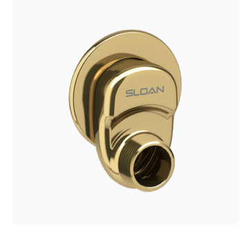
1" NPT × 1½" Offset Adapter in Polished Brass H1018A PVDPB