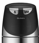
SOLIS DF RESS