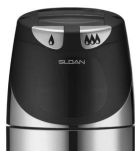
SOLIS DF RESS