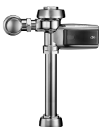
ROYAL 111 SMOOTH