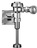
ROYAL 186 ES-S