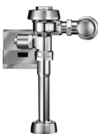
ROYAL 180 ES-S