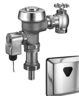
ROYAL 194 ES-SM