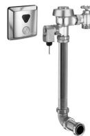
ROYAL 152 ES-SM

**Contact Your Local Sloan Representative