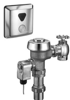
ROYAL 150 ES-SM