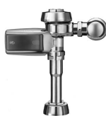
ROYAL 180 SMOOTH