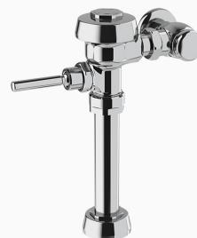
Variation Not Shown: Less Vacuum Breaker