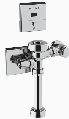
Variation Not Shown: Trap Primer