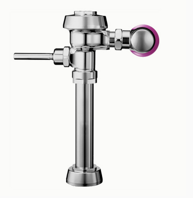
Variation Not Shown: Purple Handle