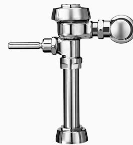
Variation Not Shown: Trap Primer