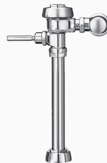
Variation Not Shown: Front of Valve Handle