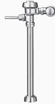
Variation Not Shown: Less Vacuum Breaker