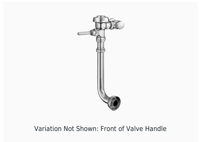
Variation Not Shown: Front of Valve Handle