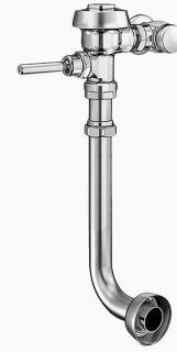
Variation Not Shown: Front of Valve Handle