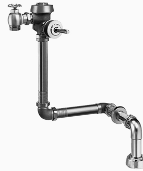
Variation Not Shown: Metal Index Push Button