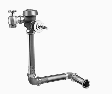
Variation Not Shown: Less Vacuum Breaker