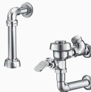
Variation Not Shown: Double Wall