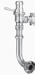
Variation Not Shown: 1.25" Flush Connection