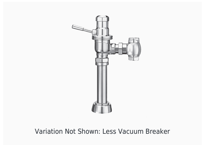
Variation Not Shown: Less Vacuum Breaker