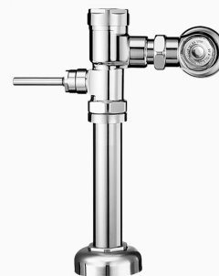
Variation Not Shown: 1.25" Flush Connection