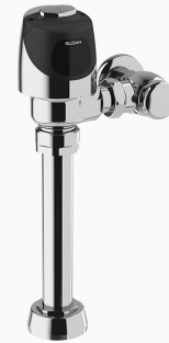
Variation Not Shown: Angle Stop Bumper