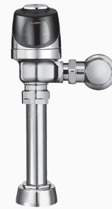
Variation Not Shown: Trap Primer