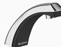
Variation not shown: 8" Trim Plate