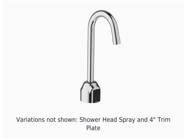
Variations not shown: Shower Head Spray and 4" Trim Plate