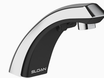
Variation not shown: 8" Trim Plate