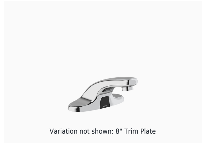
Variation not shown: 8" Trim Plate