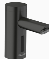
Variation not shown: ISM