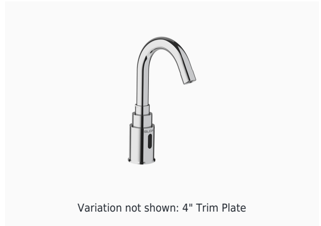
Variation not shown: 4" Trim Plate