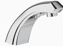
Variation not shown: 8" Trim Plate