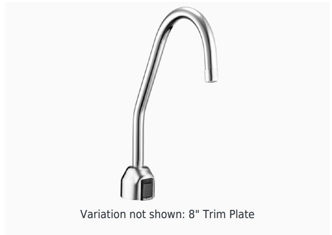
Variation not shown: 8" Trim Plate