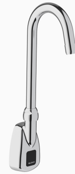
Variation not shown: Shower Head Spray