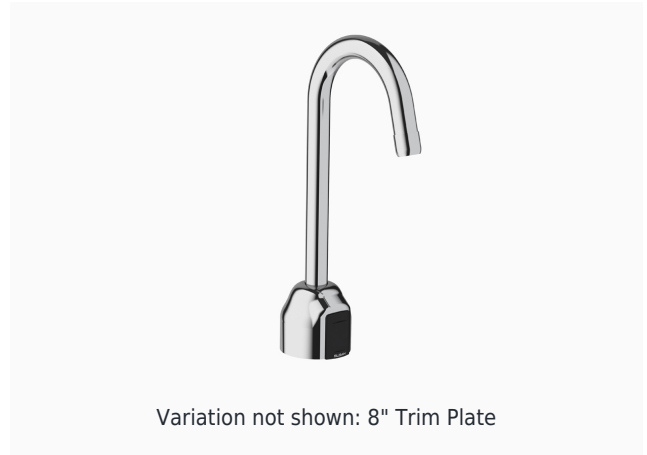
Variation not shown: 8" Trim Plate