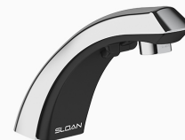
Variation not shown: 4" Trim Plate