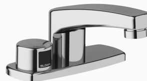
Variations not shown: Above Deck Mixer with 8" Trim Plate