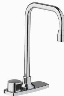
Variation not shown: 8" Trim Plate