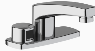
Variation not shown: 8" Trim Plate