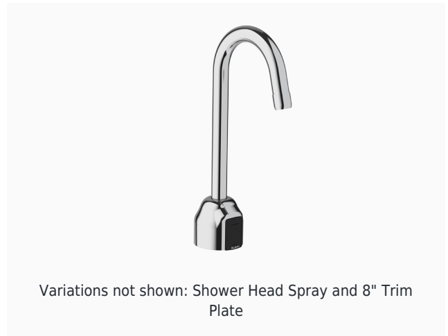
Variations not shown: Shower Head Spray and 8" Trim Plate