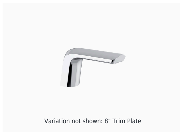
Variation not shown: 8" Trim Plate