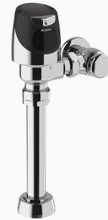
Variation Not Shown: Dual Flush